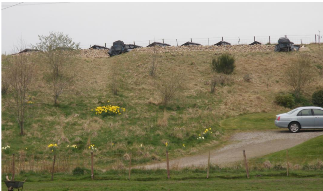
Photo 2 Detailed View of the Development from the East