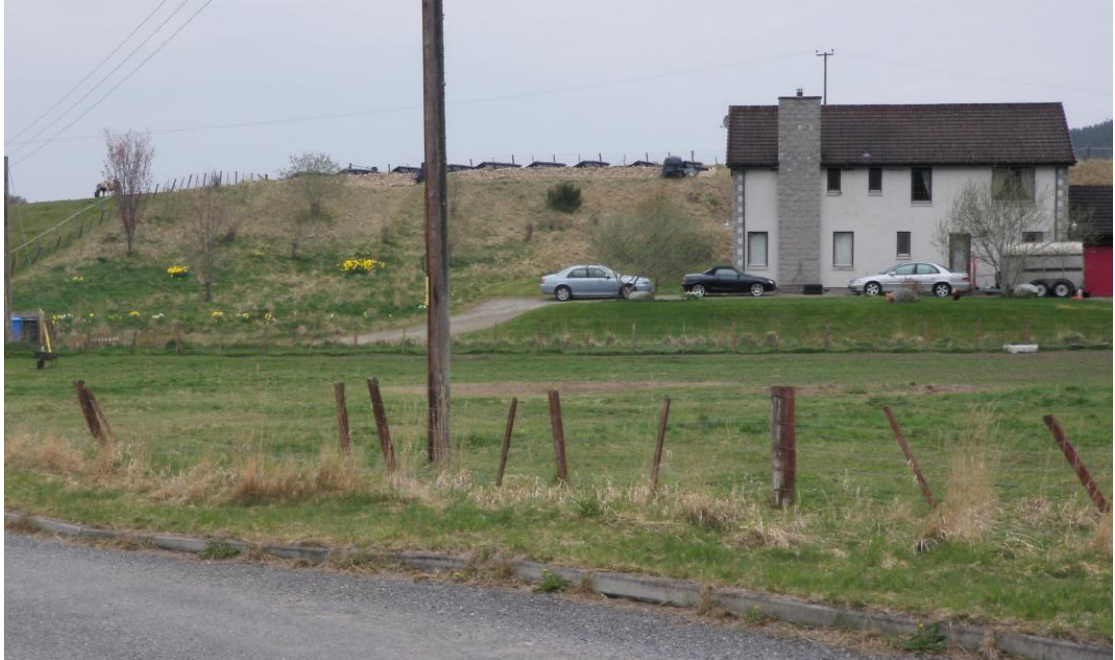
Photo 1 Site Viewed from the A928